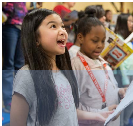
In 2012, Findley was one of the first eight schools in the nation selected to participate in Turnaround Arts.

3025 Oxford Ave. Des Moines, IA 50313 findley.dmschools.org