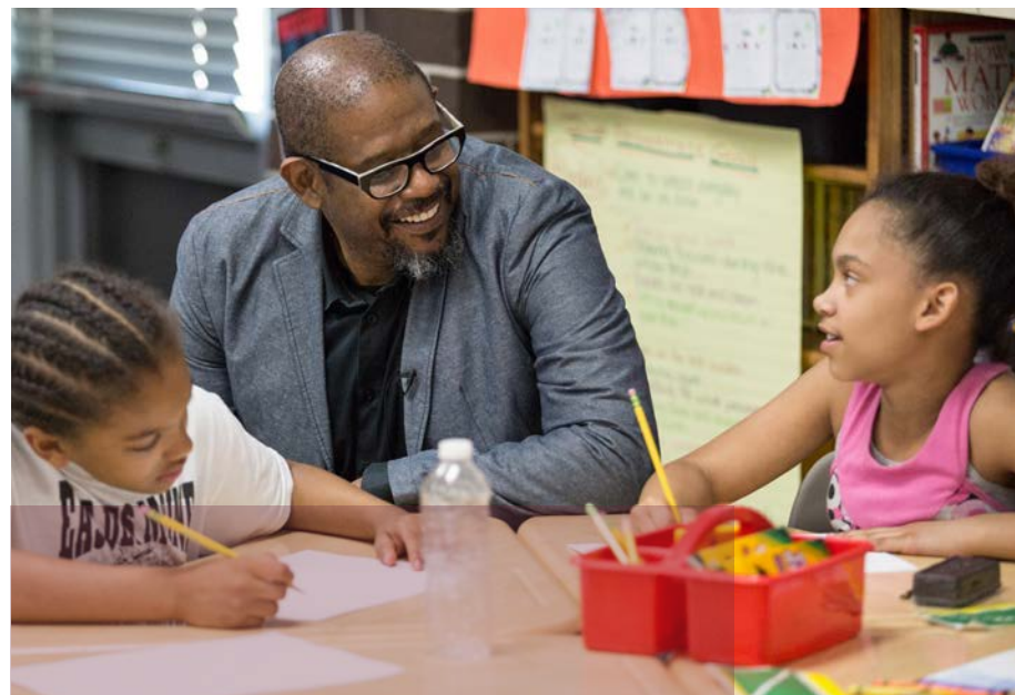
As part of the Turnaround Arts program, Oscar-winning actor Forest Whitaker worked with Findley Elementary School.

In 2012, Findley was one of the first eight schools in the nation selected to participate in Turnaround Arts. As a result, the school received intensive arts education resources, expertise and the involvement of high-profile artists over the course of two years to support their reforms. The strong arts focus in all classrooms continues to pay dividends at Findley.