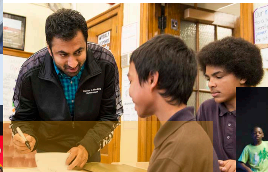
Actor and former White House advisor Kal Penn spent time at Harding Middle School, working with students and teachers.

Today Harding Middle School educates a diverse student body in grade 6-8, and celebrates students involved in a range of urban arts including dance, spoken word poetry, and graffiti. The schools dance group – the Harding Breakerz – has performed at the White House.